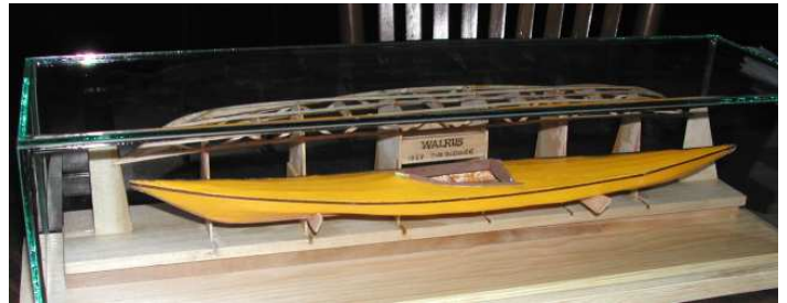
WALTER'S KYAKS IN A NICE GLASS CASE