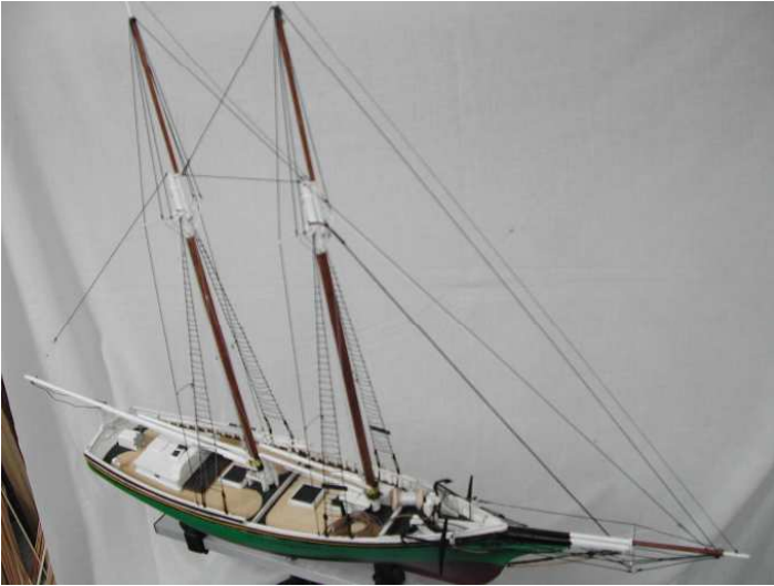
TONY'S SMUGGLER FINIHED