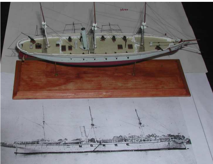
A SECOND VIEW OF ED'S USS POWHATTEN