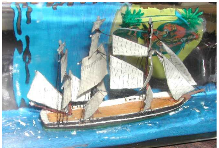
A REALLY NICE SHIP IN BOTTLE FROM WALTER