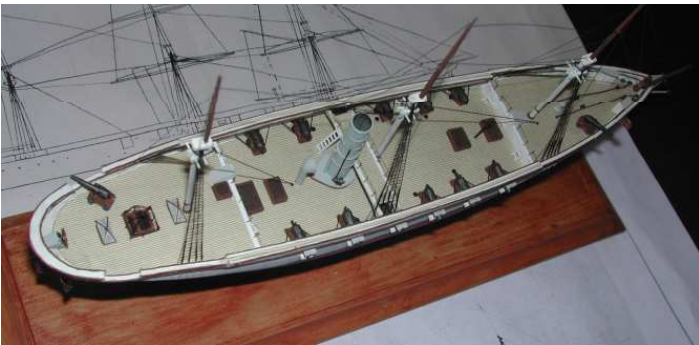
ED PARENT'S USS POWHATTEN IN 1/240 SCALE