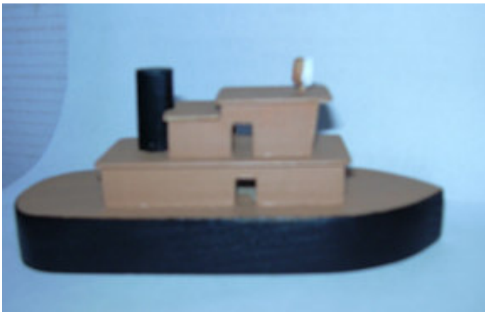
ERNIE'S SAMPLE TOY TUG