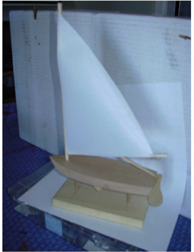
PAT'S TOY SAILBOAT FOR GIVING TO KIDS AT THE SCHOONER FESTIVAL