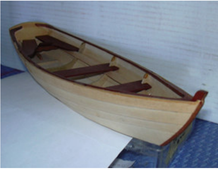
ERNIE'S SKIF AT THE H C