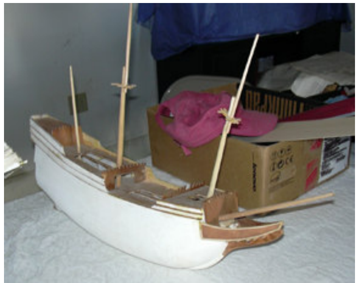
FRED SWART'S RED LION, A DUTCH TRADING SHIP