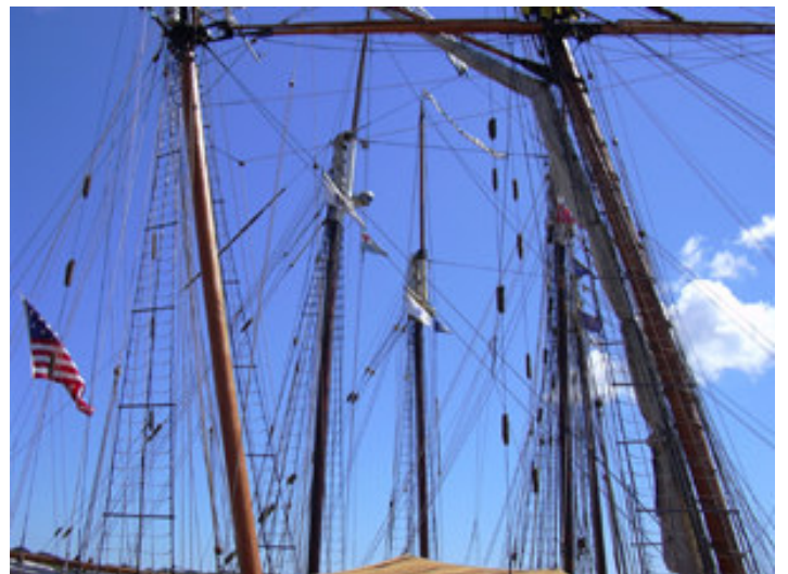
SOME PICTURES OF THE SCHOONER FESTIVAL SHIPS