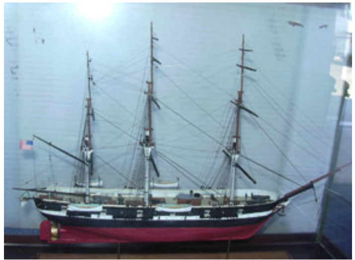
ED PARENTS USS PRINCETON I THINK

For a huge and varied marine display, the London Science Museum (behind the Natural History Museum) on Cromwell Street in the Kensington section of London can't be beat. Besides a collection of enormous steam machines it has a huge gallery of ship models dating from the ancient to the modern warship. One could spend days viewing all the models in the area.